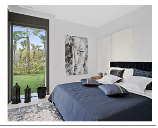
Public user | |