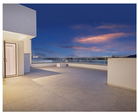
Public user | |